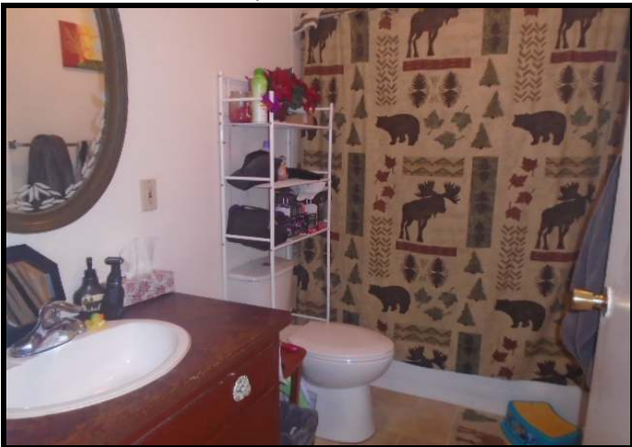
4pc Bath main