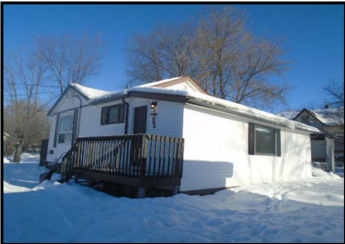
Back of Home