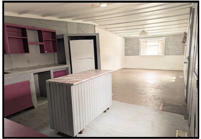
Great space in the Living Room