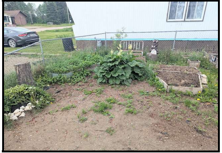
Gardens have been started for you