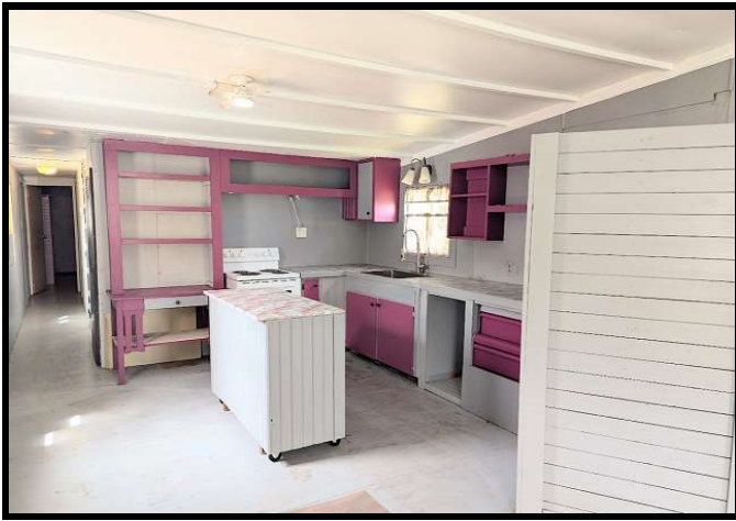
Open Concept Kitchen