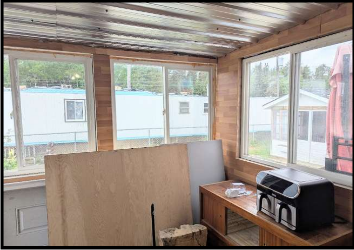
Bright Front Porch