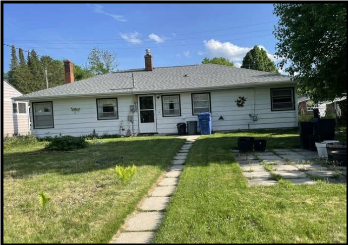
Back of home