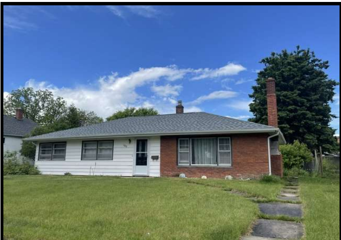
Front of home