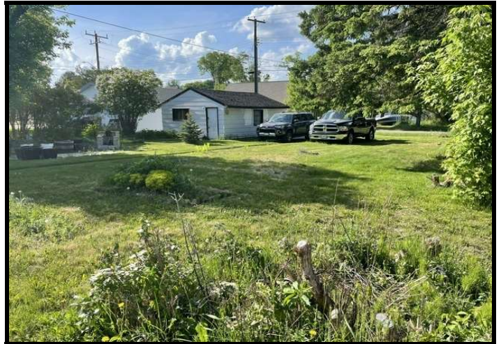
Backyard with back lane access