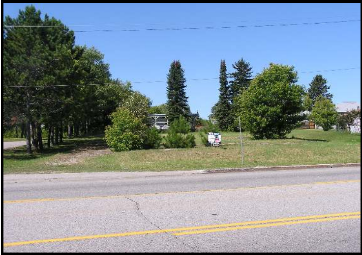
120 Grand Trunk Ave